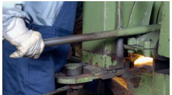
Service / Maintenance

KEK sees service as being a service with comprehensive customer orientation. We achieve this through direct customer contact – because we store, maintain and travel worldwide (e.g. stocks in Germany, USA, Turkey, Australia, Brazil, Argentina).