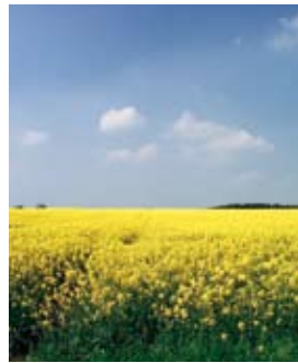
Organic Rape Cultivation