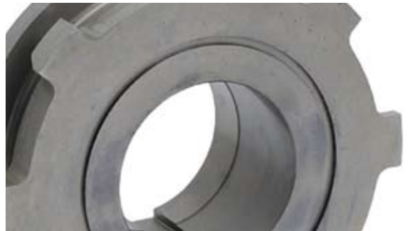
Pressing element of an oil press.

The value retention of your machines is an important component for cost reduction in your company. Regardless of whether you need wearing parts or oil presses for cold pressing, we will serve you with the