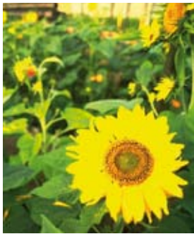
Foodstuff / Oils