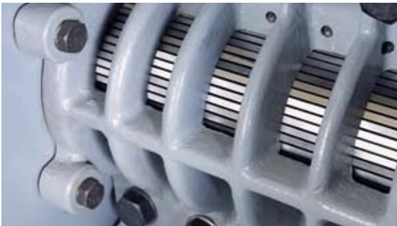
Strainer cage of an oil press with extremely wear-resistant replacement parts.

The value retention of your machines is an important component for cost reduction in your company. Regardless of whether you need wearing parts or oil presses for cold pressing, we will serve you with the